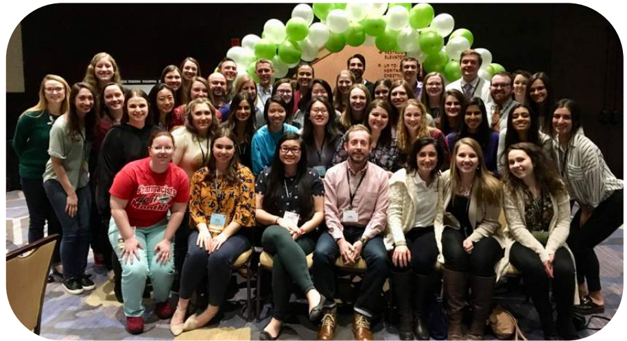
Pitt PPA Chapter at the Mid-Year conference in Lancaster, PA

Legislative Day will be here before we know it! This year it will be held on Monday, April 16 th . If you plan to go, consider completing the GRASP training program to prepare you for your meeting with a state legislator. This is a great opportunity to advocate for the future of our profession. If you have any questions, feel free to reach out to any e-board member.