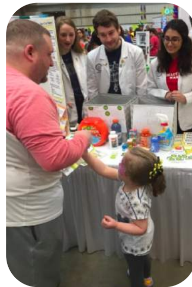
Some of our SSHP members tabling at Kid-a-palooza in February.