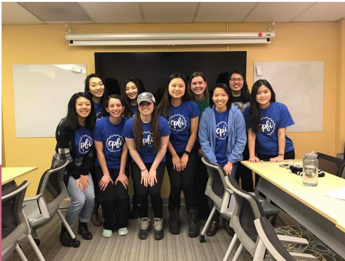
CPFI members celebrating another successful school year!

This year, we will be connecting with fellow medical and dental students as we partner with Pitt's Christian Medical and Dental Association (CMDA) for several events! Last year, we participated in the Dean's Theme for the first time and won the Most Innovative Award for our efforts. We donated over 13 first-aid kits and many extra supplies to Urban Impact. We are looking forward to see what we can accomplish with this year's Dean's Theme. In addition, we have other serving and fellowship events planned for the year that we cannot wait to get started! Finally, we are looking for a P1 representative this year to help CPFI continue to grow. If you have any questions, please stop by our table during the Back-to-School Picnic on Tuesday, September 4 th !