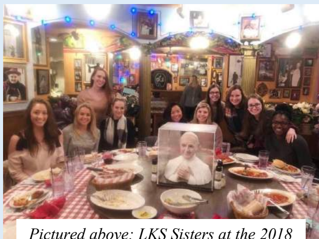
Pictured above: LKS Sisters at the 2018 Buca di Beppo Holiday Dinner.

As always, follow us on Facebook (@pittLKS) and on Instagram (@LKSDeltachapter) to stay up-to-date on all of our events.