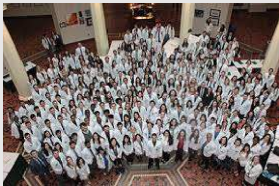
Pictured on the left: A group of student pharmacists at the Capitol during a past Legislative Day.

We are currently working on filling the positions for our E-board and looking for new ideas for next year. We will be releasing the description of these roles to those interested in the next few weeks. If you would like more information or would like to get more involved with Pitt's chapter of PPA, please feel free to reach out to one of us. Good luck with finals, and have a great summer vacation!