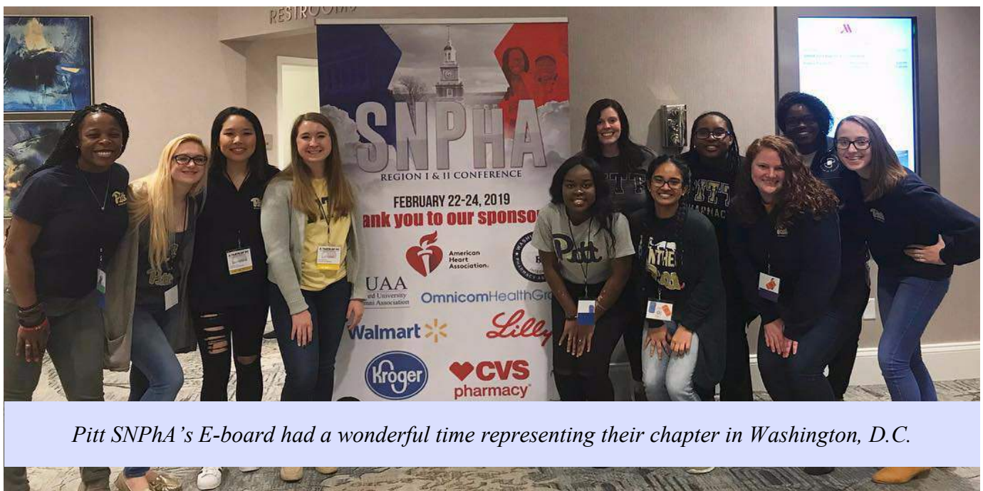
Pitt SNPhA's E-board had a wonderful time representing their chapter in Washington, D.C.