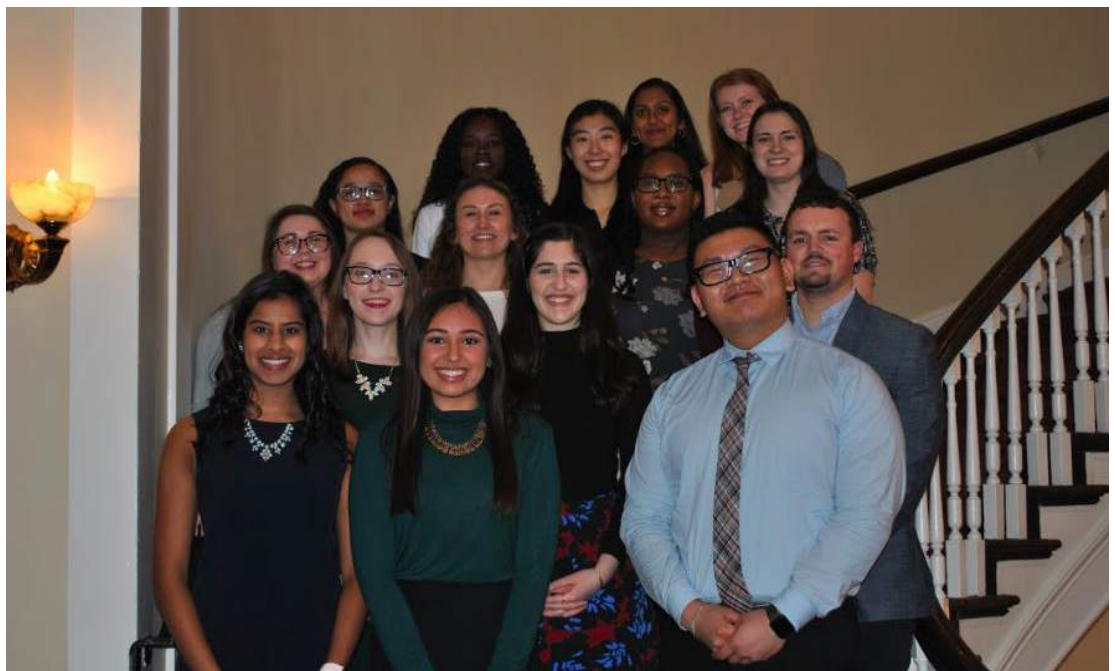
Pictured on the left: New members of PLS Beta Delta Chapter. Congratulations to our new members!