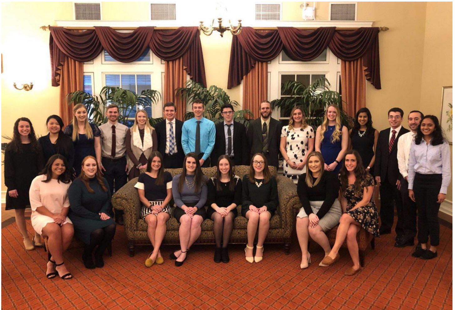
Rho Chi Induction, Class of 2021.

With the close of the school year, I hope that the P1s enjoyed their first year of pharmacy school, and we wish them good luck going into their second professional year! Incoming P3s, enjoy your summer, and good luck with your APPE rotations!