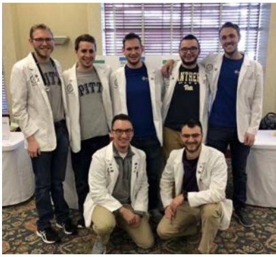
Pictured above: Our brothers volunteer for this year's MLK Day of Service.