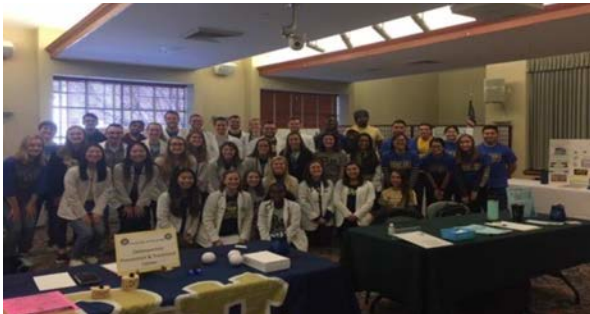
Pictured on the left: ASCP, PittServes, RxPrep, and SNPhA at the 3rd annual MLK Day Health Fair.

Last month, the University of Pittsburgh SNPhA chapter had a wonderful time volunteering for the 3rd annual Martin Luther King Day of Service Health Fair at Longwood with ASCP and RxPrep. We were able to educate over 90 residents on topics such as stroke, mental health, and chronic kidney disease as well as take some of the residents' blood pressures. This