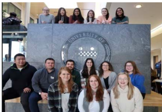
Pictured above: P2 and P3 Pitt PLS Members of the 2019-2020 school year.