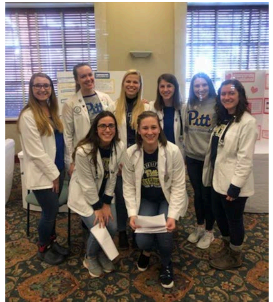
Pictured above: Student pharmacists in ASCP at Longwood Retirement Community participating in this year's health fair.

Our next GBM will be on February 11 in Salk 524 at lunchtime. As always, anyone interested in joining the organization can reach out to us via email ( pittascp@gmail.com ) or follow us on social media! Like us on Facebook (American Society of Consultant Pharmacists – Pitt Chapter) and follow us on Instagram (@ascp_pitt) to stay up to date on all things ASCP!