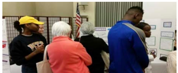
Pictured above: Educating members in the community about Brain Health and the Importance of Mental Health.

seeing everyone at the conference. Hear more about our events at our next general body meeting on Wednesday, February 19 in Salk 524. If you have any questions, concerns, or ideas, please be sure to reach out to the executive board through our Facebook page (@SNPhA.Pitt) or email snpha.pitt@gmail.com .